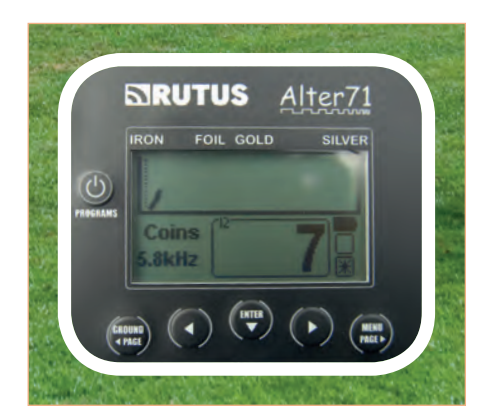
ID graph can show angle of nails.

the place! This is a common factor with Eastern European and Russian detecting systems but mild confusion can occur when experienced for the first time.