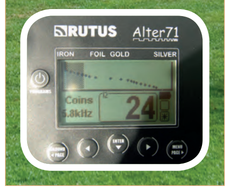
Trash target ID graph.