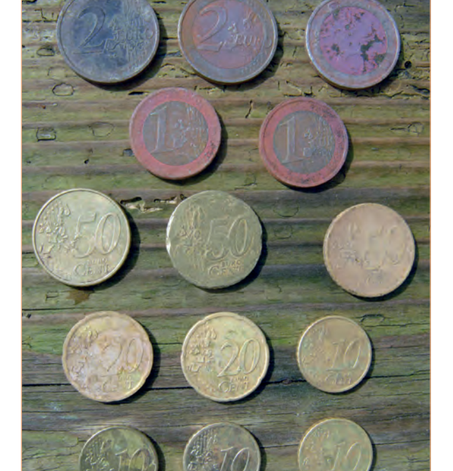
Two-metal alloy coins.

On a different note, but also relating to TIDs, the Coins Program with low 5.4kHz produced the best separation of