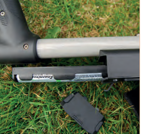
The Rutus Alter 71 battery compartment (left) and control box trigger (below).

The Alter 71 has dispensed with all that and its numbering system in the menu and option choices are all over