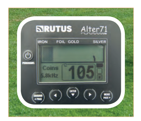
Coin ID graph.

The Instruction Manual states that: "Most soil types give a phase reading of around -87.0."