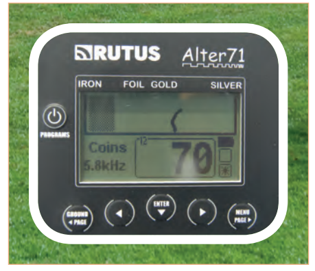
Buckle ID graph.