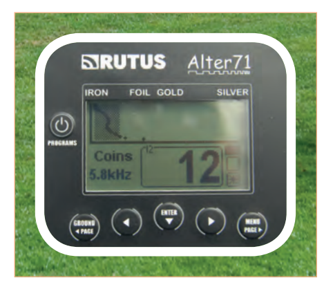
Large iron ID graph.