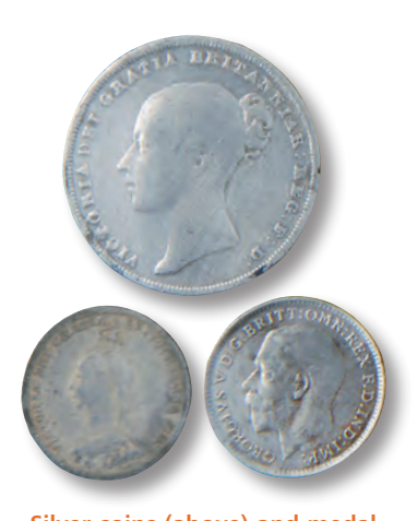
Silver coins (above) and medal from garden (below).

Two searches were conducted in woodland that I have been visiting for many years. On the first day I used the 8 inch CC coil and the second day I used the bigger coil.