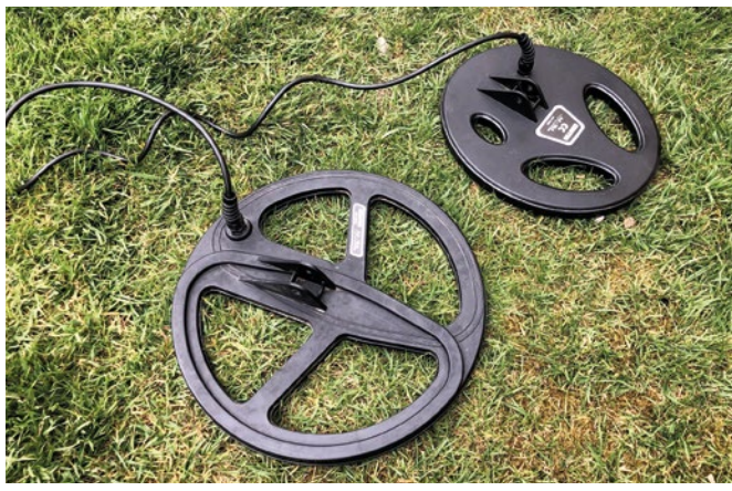
8x9" CC search that com with the Rutus.

A small thing I noticed whilst assembling the detector, which I have not seen before was the unique rubber locking straps used to retain the coil wire to the stem. This seems to be a nice little