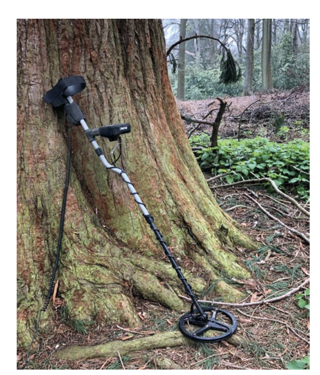
Area of woodland we searched.

already acidic sandy soil site with plenty of ancient animal urine in the ground. I was rather intrigued too see if anything found would be too corroded to be of note.