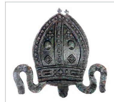
Sunday school cap badge

On this site I was able to really have a play with all the settings on the Alter 71 and use the two coils that came with the machine: the 11-inch DD