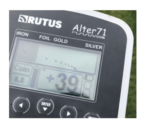
Iron on the hodograph display.

All Metal Motion A mode that allows you to search for deep large items but still allows you to separate close targets better than in all metal.