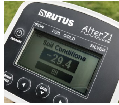
Ground balance warning.