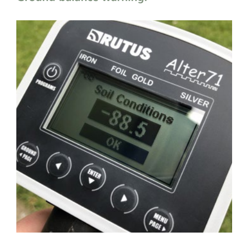
Ground balance OK.