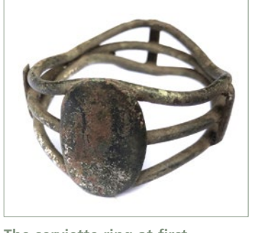
The serviette ring at first thought to be a Roman bracelet.

and 8x9-inch CC. I found the 11-inch DD coil gave excellent depth, was a really good all-rounder, well balanced for the machine and loved picking up coins. With the machine on the standard coin mode and playing with the frequencies, I managed to dig over 30 coins in two hours. These were mainly Victoria pennies, probably lost from mode as the contamination and hour and through the signal rangir inches down was a bishound identified as badge from the machine This turned