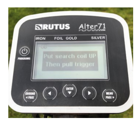
Start-up message for ground balancing.